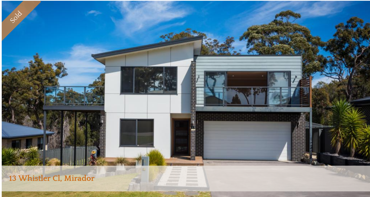
13 Whistler Cl, Mirador