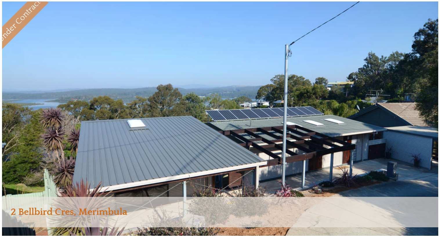
2 Bellbird Cres, Merimbula