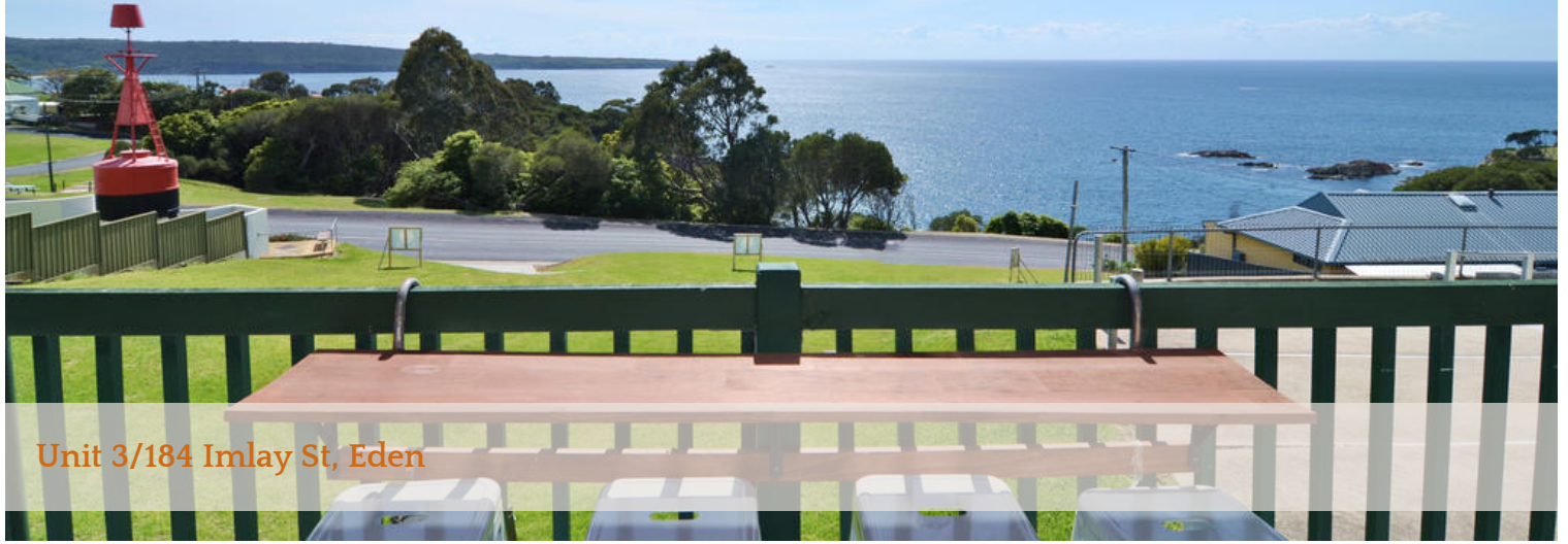
Unit 3/184 Imlay St, Eden