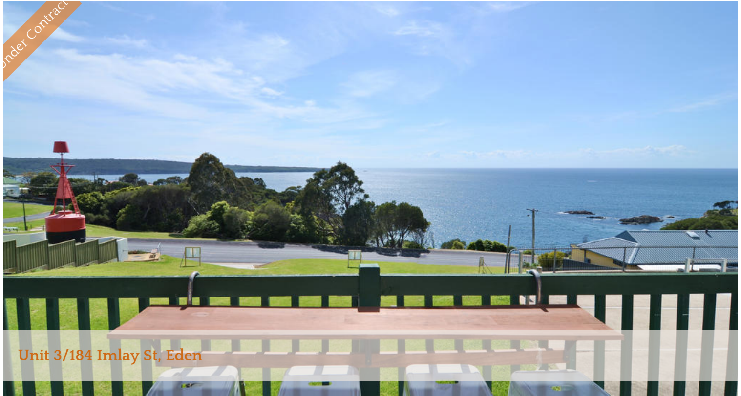
Unit 3/184 Imlay St, Eden