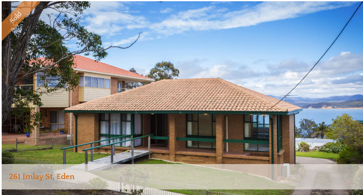
261 Imlay St, Eden