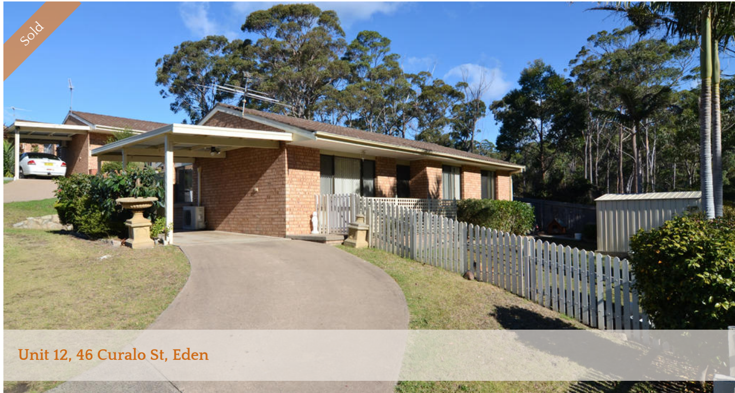
Unit 12, 46 Curalo St, Eden