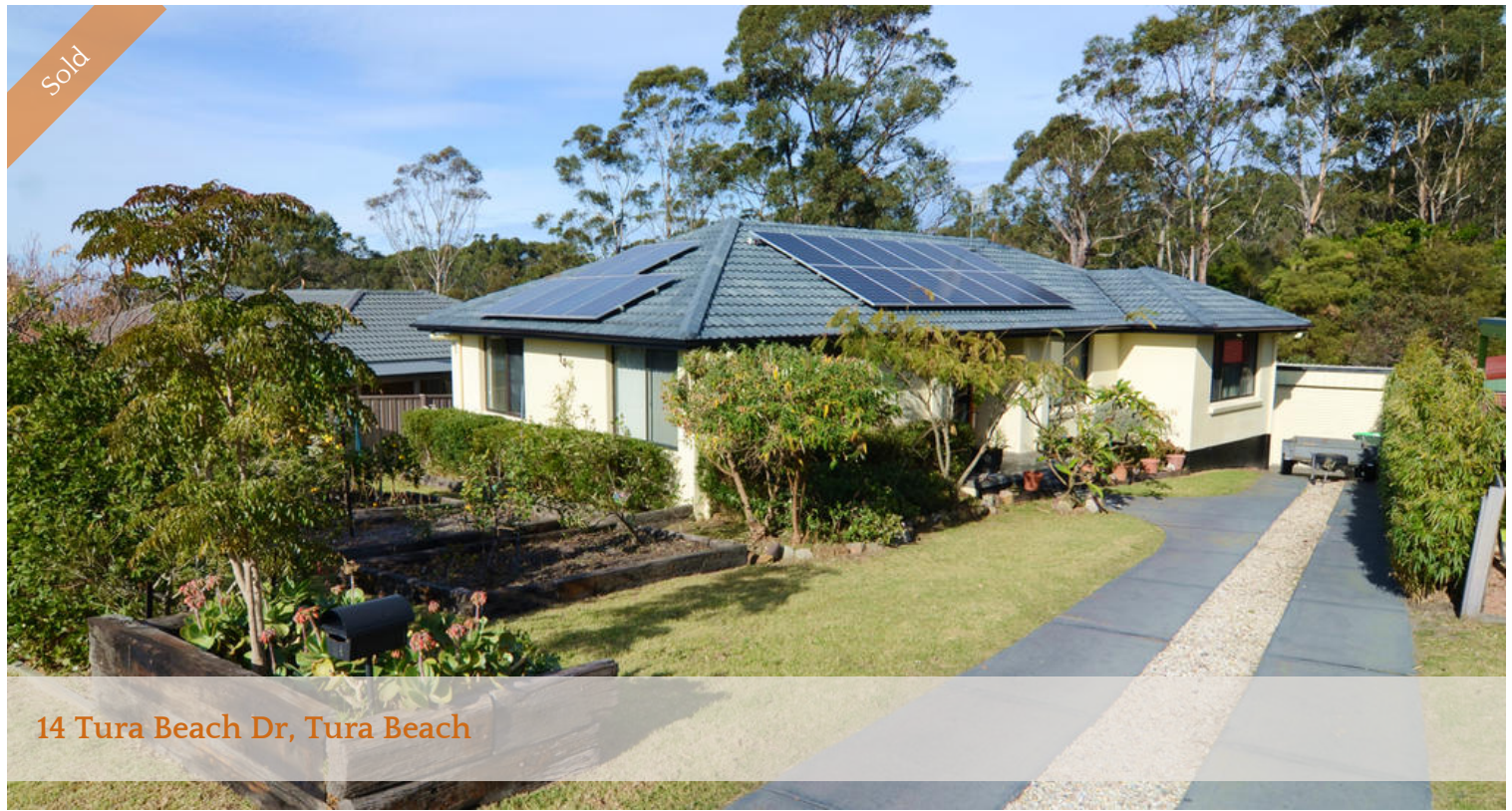
14 Tura Beach Dr, Tura Beach